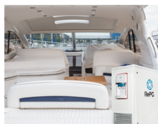
Yachts, Sailboats, and Ships