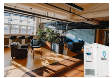
Waiting Areas, Hotels